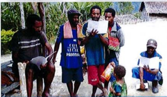
Dolei youth inspect the Yamap Scripture readings booklet