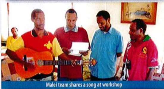
Malei team shares a song at workshop