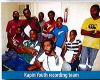
Kapin Youth recording team